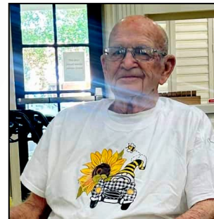
Best dressed man!