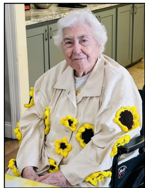
Best dressed lady!